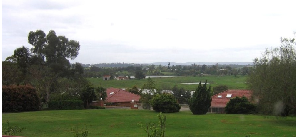
The view from Monte Pio—Venue for today's Chapter

We ended with a hymn focusing on the presence of God – 'In our living and our dying We are bringing You to birth.'